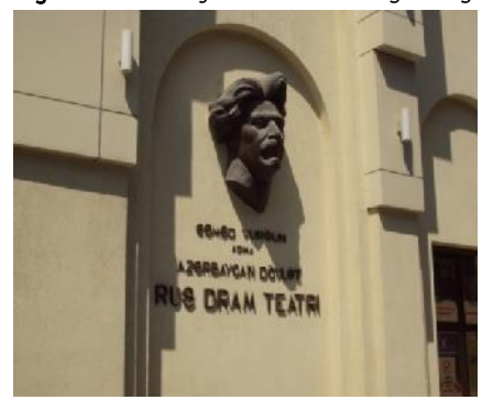
Figure 1. Azerbaijani-Russian bilingual sign