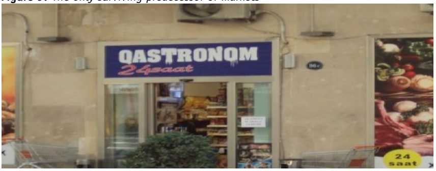
Figure 10. Traditional spelling

Figure 9. The only surviving predecessor of markets