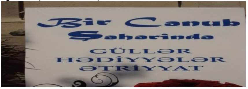
Figure 17. A sign with a 'new' coinage