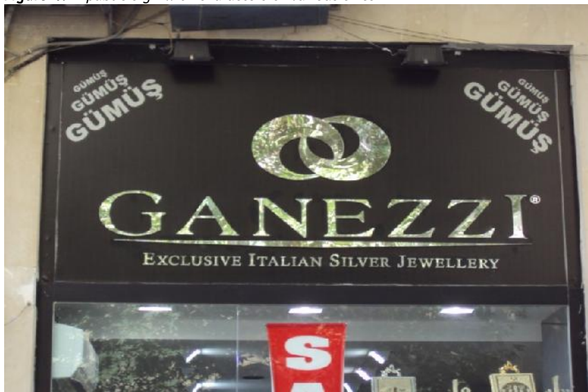
Figure 5. A sign symbolizing self-perceived ethnic identity

Figure 4. A public sign with characters of various sizes