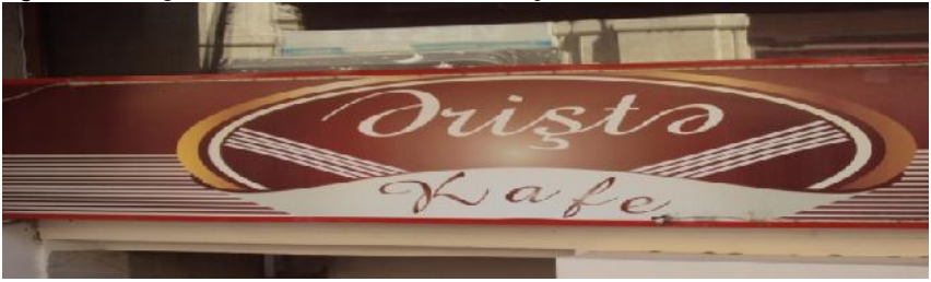
Figure 14. A sign with a Turkish text

Figure 13. A sign with a name taken from Azerbaijani cuisine