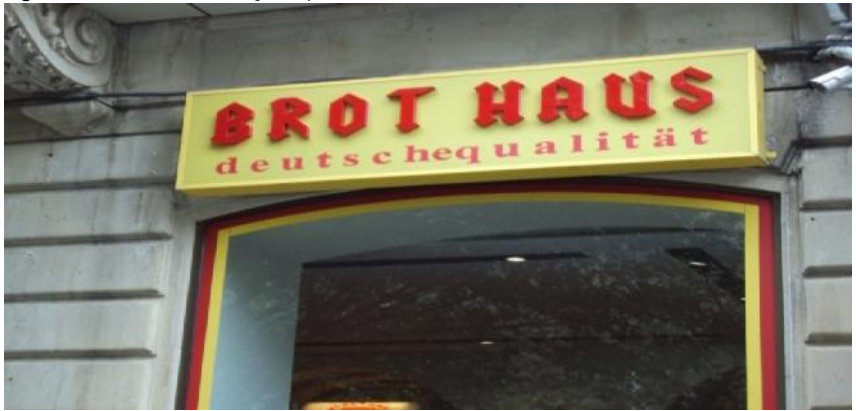
Figure 7. An Azerbaijani Bakery shop