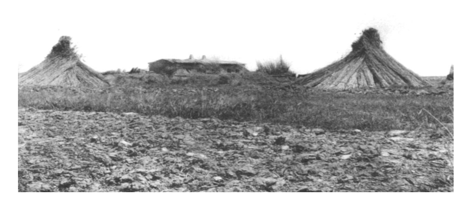
Picture 4 – Winter encampment of the rich Kazakhs. Perovsk region, Maslov volost. 1910. (Materialy po kirgizskomu zemlepol'zovaniju, 1912: 48 A)