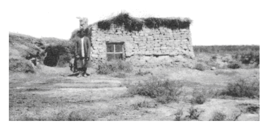
Picture 3 – The winter encampment of the poor. Sauran volost. 1910. (Materialy po kirgizskomu zemlepol'zovaniju, 1912: 32 A)