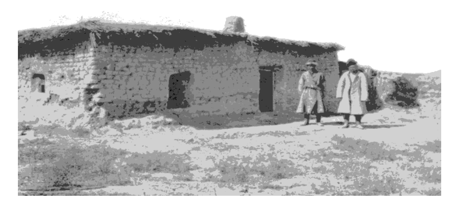
Picture 2 – Middle life style of the Kazakhs' winter encampment. Perovsk region, Sauran volost. 1910. (Materialy po kirgizskomu zemlepol'zovaniju, 1912: 32 A)